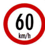
Max speed limit 60km/h