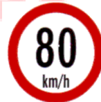
Max speed limit 80km/h