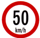
Max speed limit 50km/h