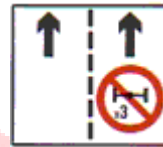
In a tunnel goods vehicles cannot use right-hand lane. (by reference to number of axles)