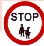
School wardens stop sign