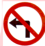
No left turn