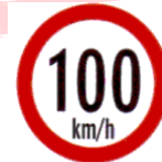
Max speed limit 100km/h