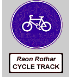
Start of cycle track