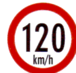
Max speed limit 120km/h