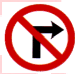
No right turn