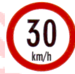
Max speed limit 30km/h